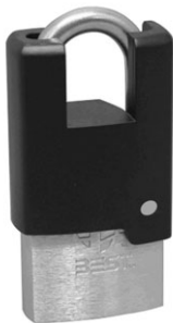
21B Padlock with Stainless Steel Shroud